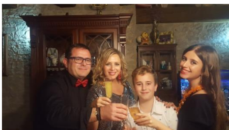
There is a photo of my family in new year night.